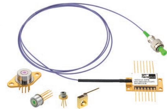
nanoplus DFB lasers on TO66, TO5, TO5.6, c-mount and SM-BTF

If you require custom specifications , please contact us. Nearly 80 % of our devices are more or less customer-specific. As nanoplus is a fully vertically integrated company , we control the entire process chain from design to packaging. Both nanoplus production facilities are based in Germany . To guarantee consistent product quality we apply a strict and ISO certified quality management system at all levels.