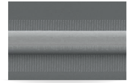
Overgrowth-free DFB device processing

Our excellent spectral purity is characterized by a large side mode suppression ratio (SMSR) of > 35 dB , giving your system a low signal to noise ratio against crossinterference.