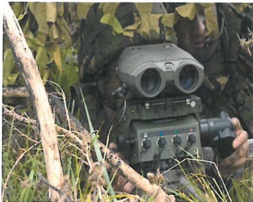
Rangefinders 905nm and 1550nm Pulsed and Multi-Junction Lasers