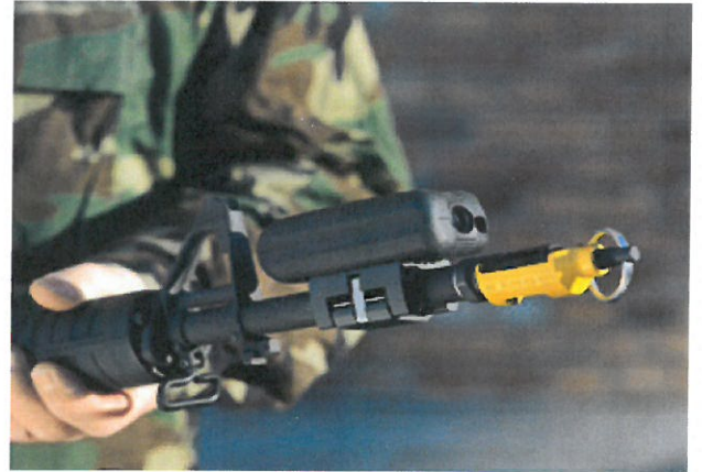
(SAT) Small Arms Transmitter 905nm Pulsed Lasers