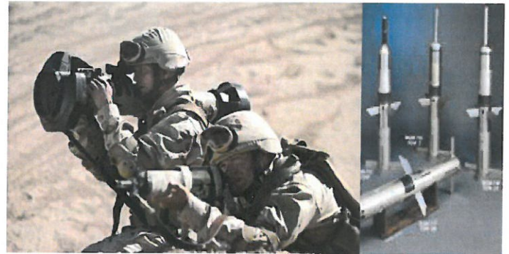
Optical Missile Fuses 850 & 905nm Pulsed Lasers